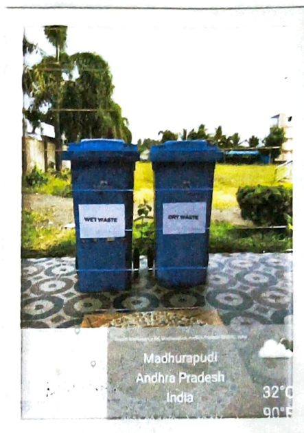
Dustbin for solid waste