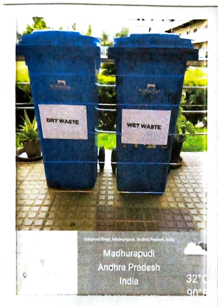
Dustbin for solid waste